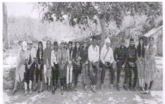
At Ashirgad (Madhya pradesh)