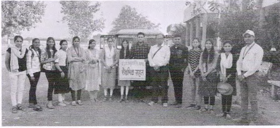
Participated Students along with Staff