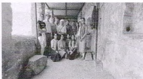
At Ashirgad Visit to Ashavthama Temple