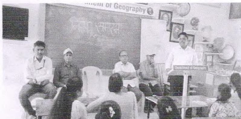
Hon. Institute Principal Address to Students