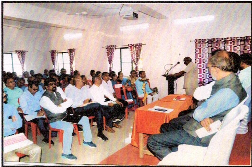
SYBA Geography Syllabus Framing Workshop date February 23.2019